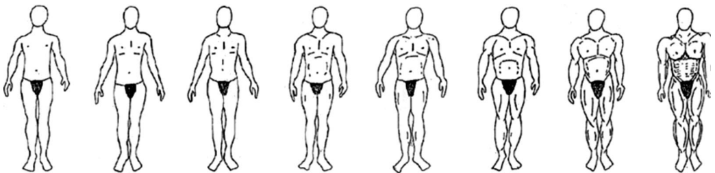
Figure 1. The Muscle Silhouette Measure (MSM).

The FSM contains an array of eight hand-drawn silhouettes of men that increase linearly in body fat (Figure 2). The first silhouette presents a slender man with little body fat, and the last one presents an obese man. Using photos provided in the Atlas of Men as a guide, the silhouettes increase primarily in the overall