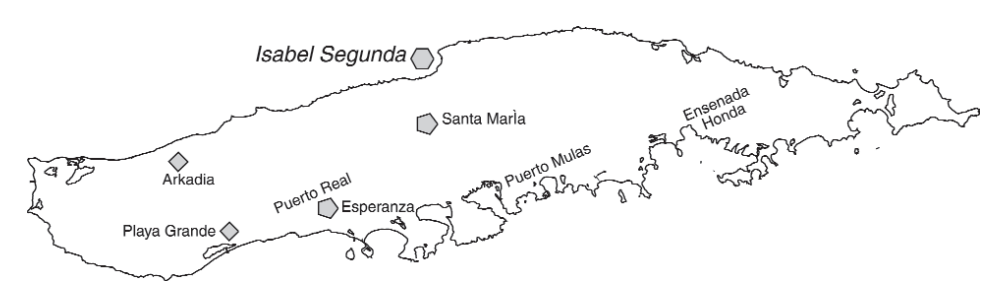
MAP I Vieques, Approximate Location of Sugar Mills, ca. 1919

At the beginning of the 20th century Vieques had four sugar centrales : the Santa María; the Arcadia; the Esperanza, also known as Puerto Real; and the Playa Grande.<sup>17</sup> When these are compared with the centrales of the great corporations that established themselves in Puerto Rico after the U.S. occupation, they appear as relatively modest enterprises. The Guánica mill, for instance, reached an output of over 100,000 tons of sugar yearly, and the Cambalache mill in Arecibo produced more than 40,000. In Vieques the largest central produced 13,000 tons yearly, which in the sugar world of the early 20th century was not an insignificant amount. Even so, it was not comparable to the output of Puerto Rico's largest centrales . In 1910 none of the mills in Vieques