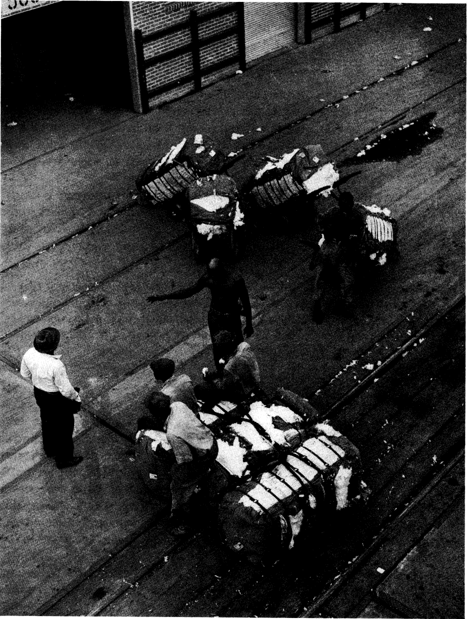
African-American stevedores in Houston, Texas, seizing a free moment for rest and relaxation.