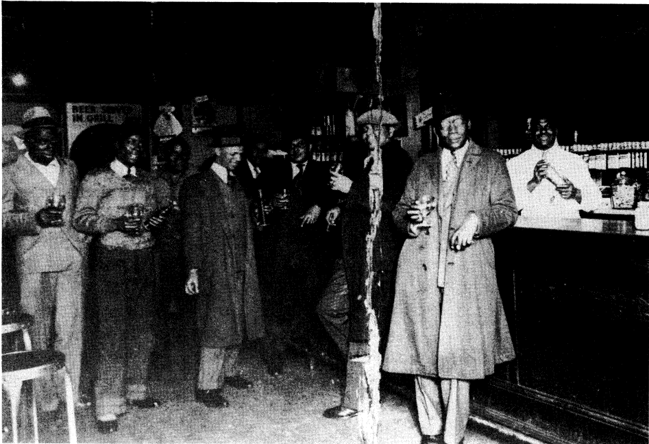
Black men relaxing in a popular bar in Atlanta, Georgia, c. 1940s.

the vicissitudes of southern life. They went with people who had a shared knowledge of cultural forms, people with whom they felt kinship, people with whom they shared stories about the day or the latest joke, people who shared a vernacular whose grammar and vocabulary struggled to articulate the beauty and burden of their lives. Places of leisure allowed freer sexual expression, particularly for women, whose sexuality was often circumscribed by employers, family members, the law, and the fear of sexual assault in a society with few protections for black women. Knowing what happens in these spaces of pleasure can help us understand the solidarity black people have shown at political mass meetings, illuminate the bonds of fellowship one finds in churches and voluntary associations, and unveil the conflicts across class and gender lines that shape and constrain these collective struggles.