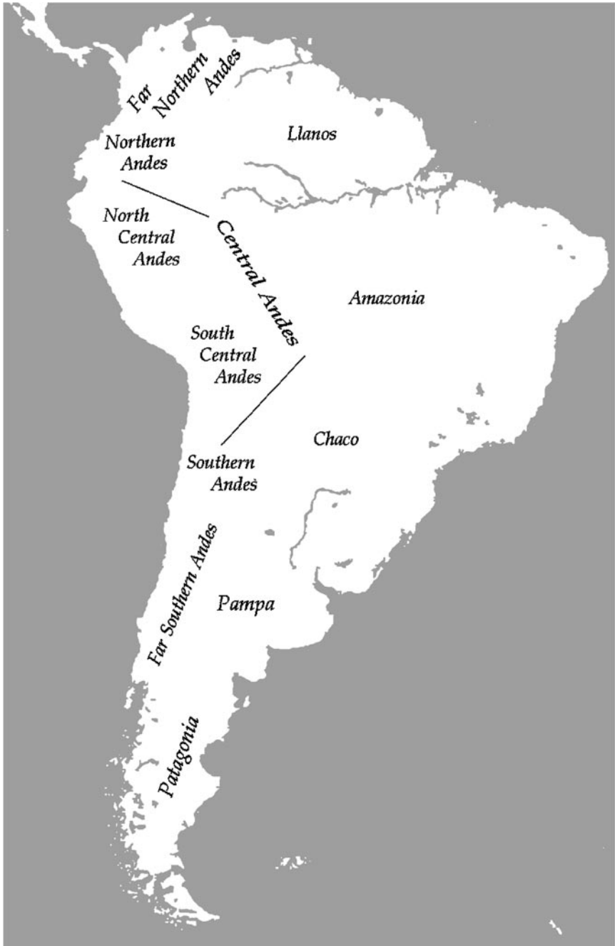
Figure 1 South American cultural areas.